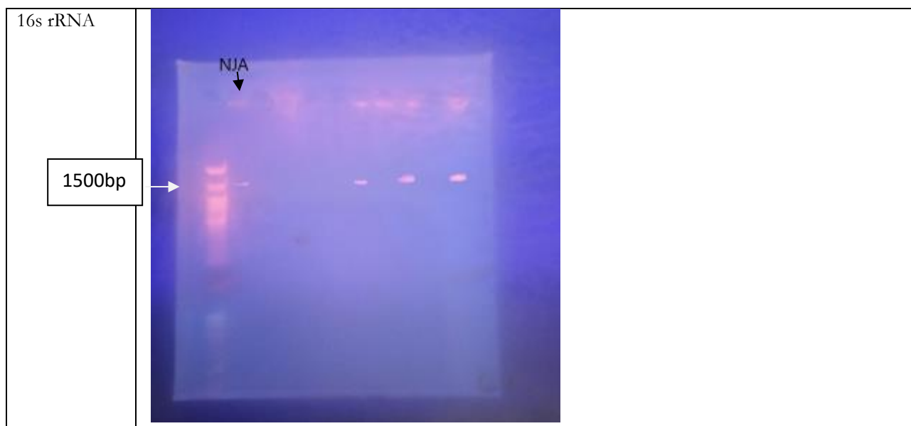
Figure 5: Agarose Gel Electrophoresis for 16s rRNA Genes of Klebsiella pneumoniae