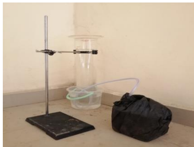
Figure 1 Fabricated Mini Laboratory Anaerobic Digester

The digestion process was done using fabricated laboratory mini digesters with two setups. The first setup measured the biogas yield in terms of volume. Portable digesters were fabricated using 1L empty plastic gallons, a rubber strip, and a polyvinyl chloride (PVC) tube of 150cm in length and 0.8cm internal diameter. A hole was bored into the cover, and the tube was inserted into the hole bore on the plastic cover and tightened using a strip of rubber with one end of the PVC free (i.e., unattached), which conveyed the gas from the digester to 1000cm 3 capacity measuring cylinder which is filled with water and inverted into a bowl containing water for gas collection using water displacement method illustrated in (Figure 1). This was used as a digester under mesophilic conditions.