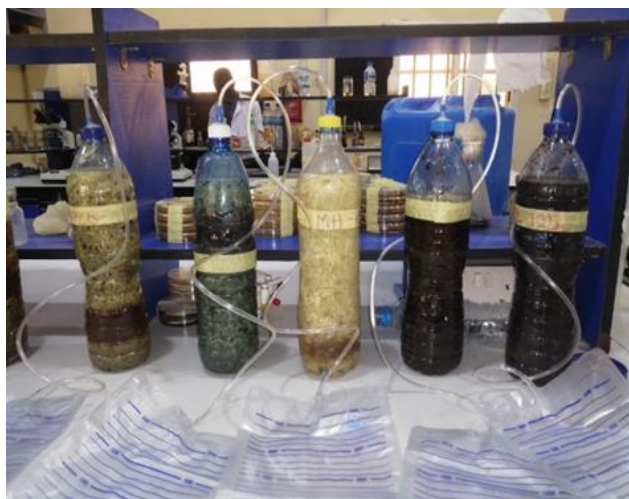
Figure 2 Mini Laboratory Digester for Biogas Collection Using a 2L Urine Bag

gas, which was later evaluated using a biogas analyzer to determine the methane content of the gas.